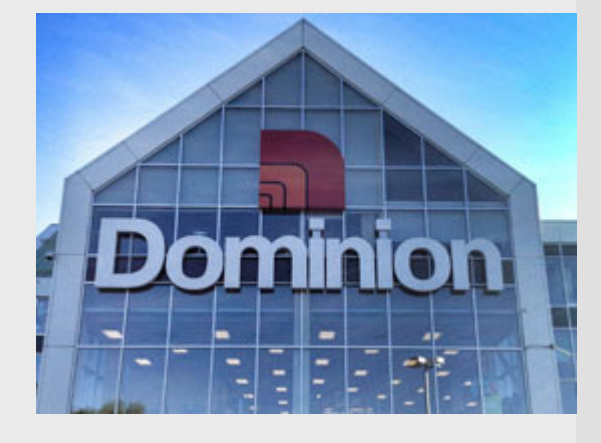
Unifor opposes move by Newfoundland Dominion to cut