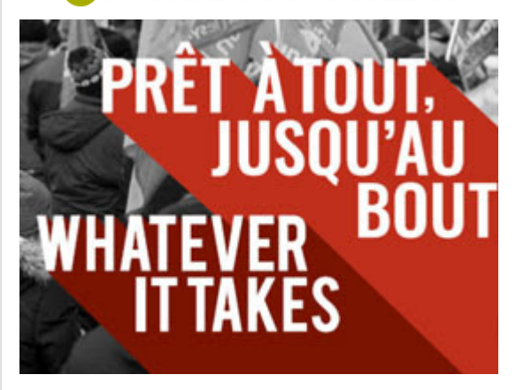
Final day to register to join members from across the country at the Unifor Constitutional Convention, August 19-