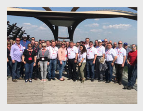
Delegates from Unifor's energy locals met in Fort McMurray to strategize and discuss